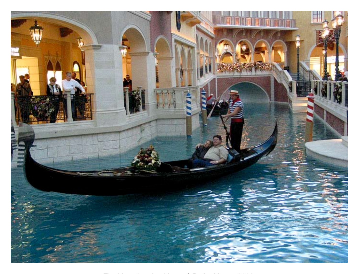
The Venetian, Las Vegas

And then you can find that the canals of Venice reproduced in Las Vegas, happen to be flowing as you stand on the fourth floor of a building, with fake facades all along the sides, and every one quite content as they hear fake gondoliers sing out in what could be said are well intentioned versions of Italian interpretations but certainly no real Italian.