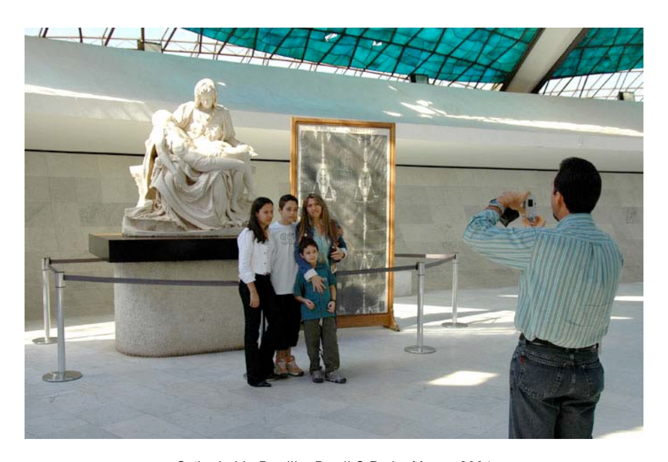
Cathedral in Brasilia, Brazil

But going back to the issue of representation, let us take a look at the picture taken in the Cathedral in Brasilia, which I visited recently, you will find they have there a reproduction of the Pieta by Michael Angelo in Rome, and the Holy Shroud of Turin. The latter one is a framed enlargement of an X-ray image (already a further level of abstraction), and what do people do there? They take pictures of themselves in front of such representations. For them apparently there is no difference or need to differentiate between the original and such reproductions.