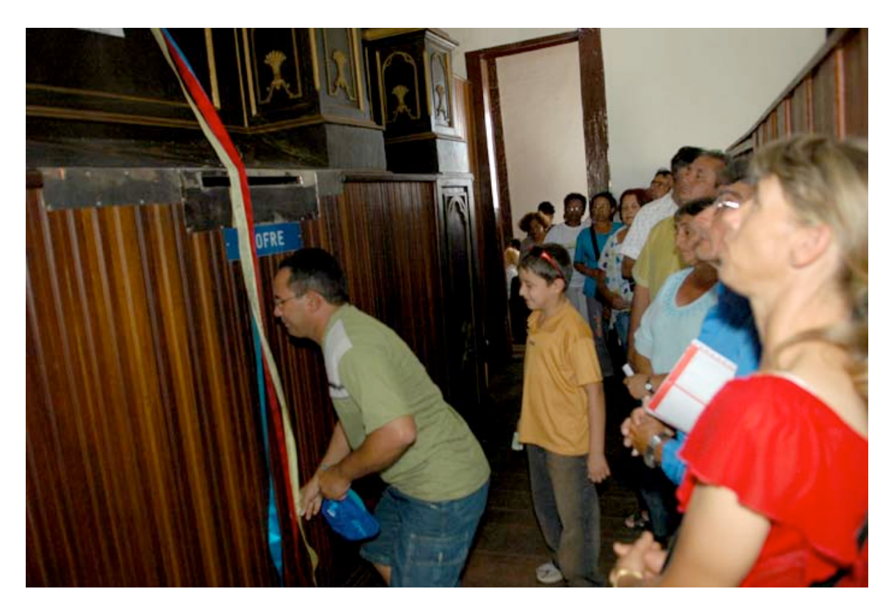
Trindade, Brazil

Notwithstanding, the multitude that had come from the entire region, which might easily have been three hundred thousand strong, and gathered in the city of Trindade in the State of Goias in Brazil, found no problem in bringing their devotion and money to the coffers of the church which was being very forthright in telling their devotees that what they had to venerate was a reproduction. All these good people had come for their annual "Romeria Do Divino Pai Eterno" which is celebrated on the first Sunday of July of each year.