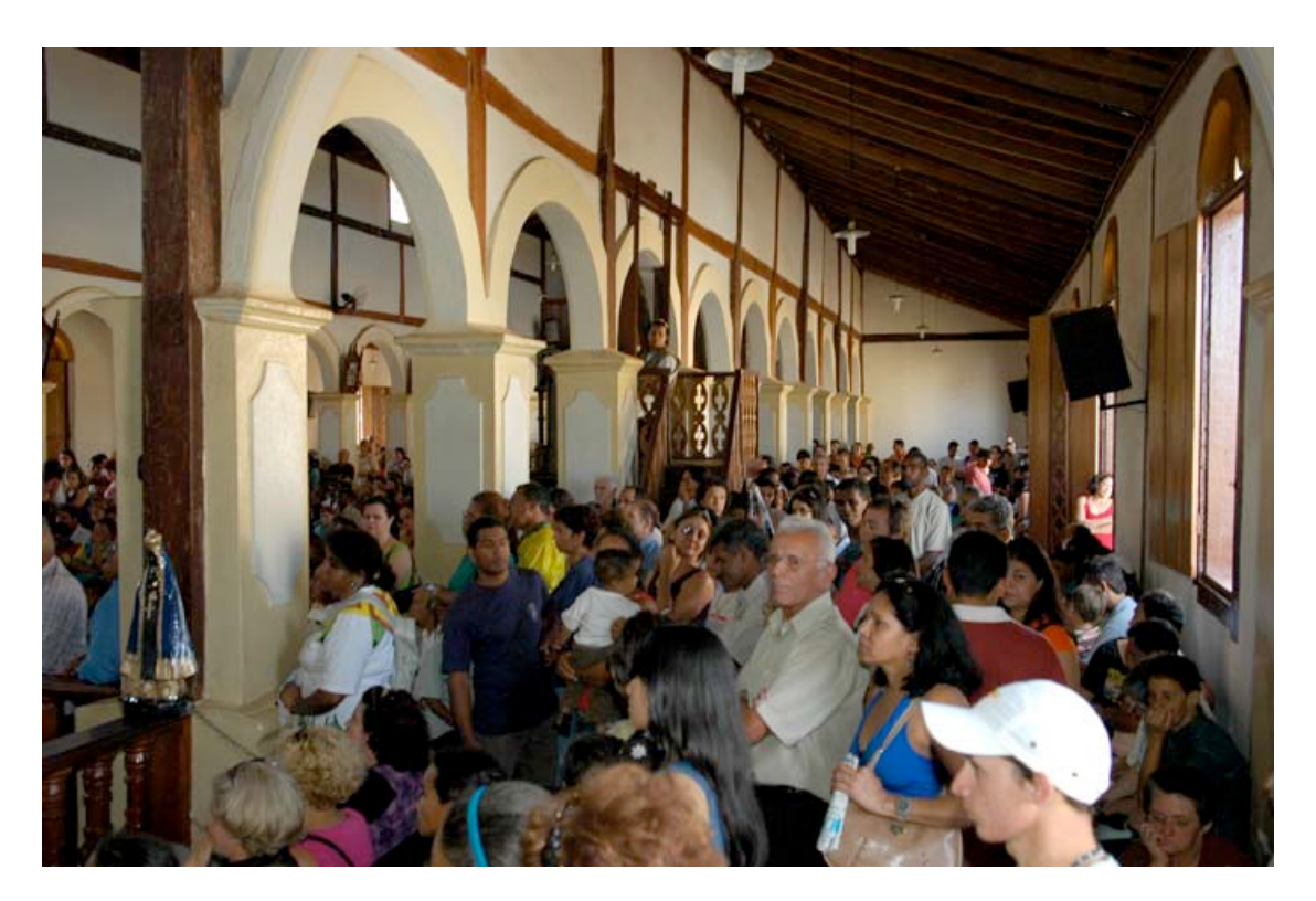
Trindade, Brazil