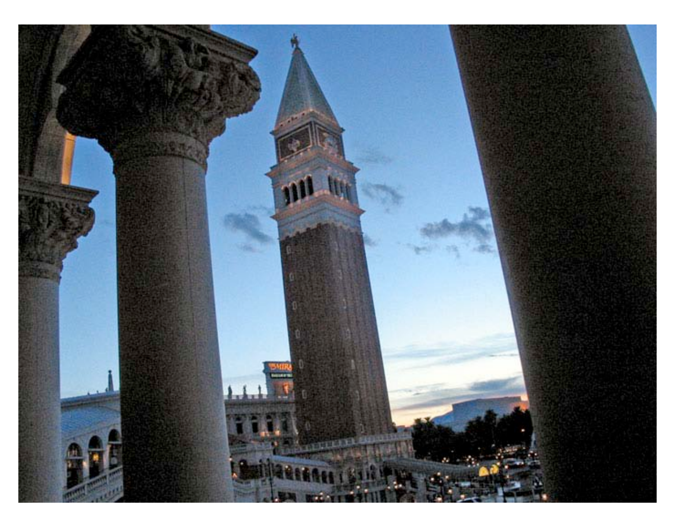
The Venetian, Las Vegas

(see http://europeforvisitors.com/venice/articles/campanile_di_san_marco.htm)