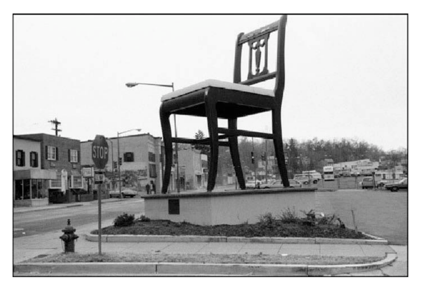
Monumental Chair, Washington, D.C.

When I first exhibited this image of the chair standing there on a pedestal in the street, everyone who saw it was of course convinced that I had placed the chair there using Photoshop. The possibility that this would be a real chair was of course dismissed right away. The more plausible explanation of a digital manipulation made more sense than the extravagant idea that in Washington, DC, there is in fact such a chair. The notion of the real and and the fake had come full circle. We now tend to dismiss the real because it looks like a fake.