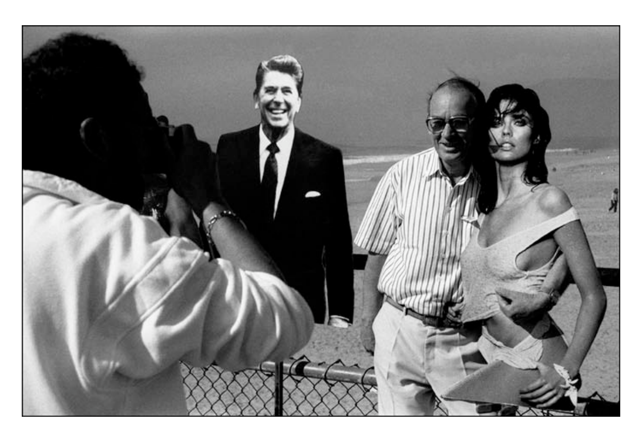
Cardboard, Malibu, California