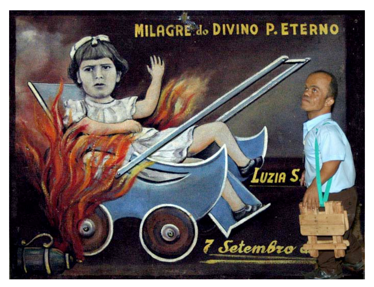
Trindade, Brazil

We are left with the idea to question the moralistic approach that so many photographers have taken towards the representation of the image in these digital times, in so far as pictures "telling the truth". As what is the truth that is in fact being told through images?