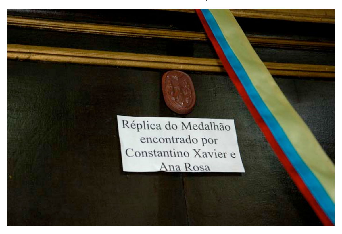
Trindade, Brazil